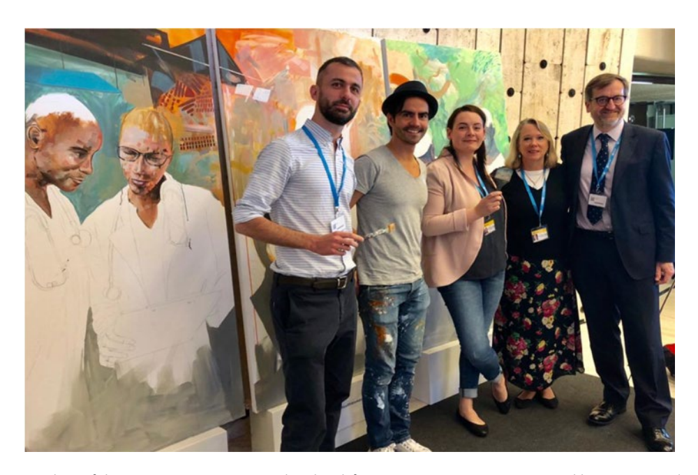
FIGURE1. Members of the WFNS-WHO Committee take a break from WHA meetings in Geneva to add a neurosurgical contribution to a mural honoring health care worker at WHO Headquarters.

task force, which advocates for folate fortification regulations to reduce the global burden of spina bifida and anencephaly (5). Another is the Surgery, Obstetrics, Trauma, and Anesthesiology at United Nations General Assembly (SOTA at UNGA) series of webinars that G4 Alliance sponsored at the United Nations General Assembly in September 2020. "The first-ever virtual UNGA allowed G4 Alliance, WFNS and other SOTA specialties to present our shared message online forum, where global surgery advocates directed the content while bureaucrats and diplomats were the intended audiences," according to Gail Rosseau, Chairman of the WFNS-WHO Liaison Committee and a member of the G4 Alliance Executive Committee. The message of the four webinars which were scheduled strategically throughout the UNGA meeting was for global political leaders to work from "Pandemic to Progress," i.e., to use the enormous and unexpected expansion of resources necessitated by the current pandemic to transition to health care systems worldwide that include access to emergency and essential surgery.